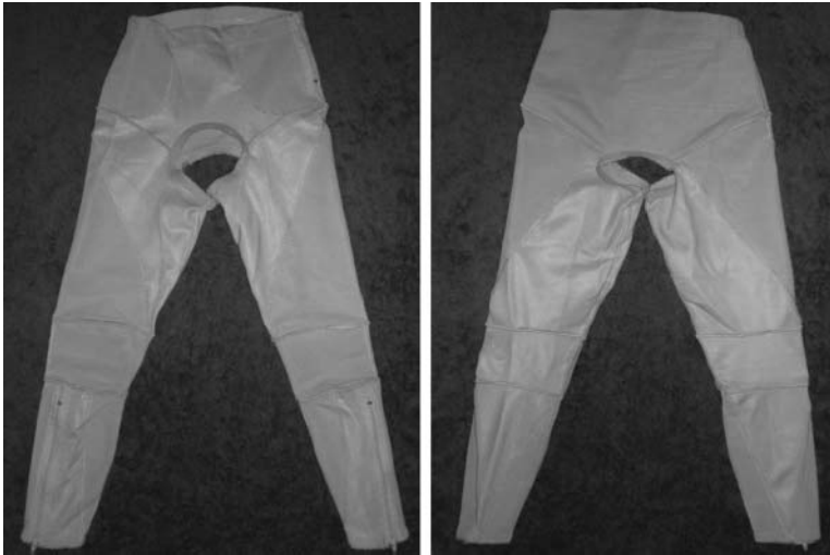
Figure 1. Shows the anterior and posterior view of the dynamic elastomeric fabric orthotic (DEFO) leggings.